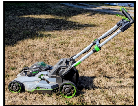
Electric Lawn Mower

The clean energy revolution is here. Solar, wind and batteries are the cheapest form of power on the planet, lowering costs, creating new jobs, and strengthening our communities. The price for this clean energy has fallen 90 percent in the last decade... Bill McKibben, Sunday.earth